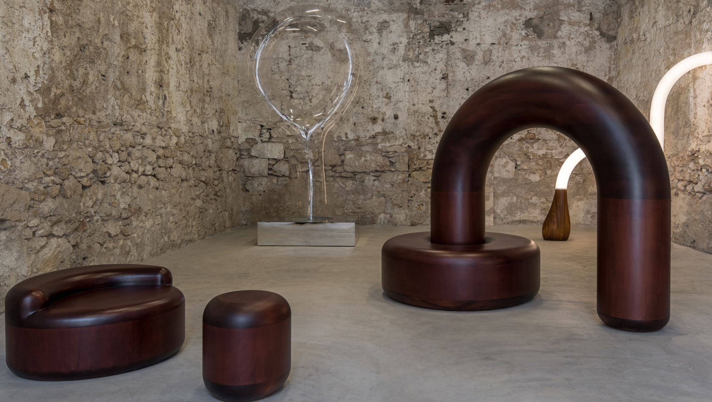
Installation view of 'Volax', an exhibition by Objects of Common Interest held at Athens' Carwan Gallery in autumn 2021, featuring a low chair, side table, bench and arch in linden wood; 'Inflatable Loop Large', a glass sculpture inspired by the culture of the Cyclades Islands and the work of Constantin Brâncusi; and 'Tube', a floor light in acrylic

'I love their capacity to use forms in an individual and coherent way,' says our judge Luca Guadagnino, who praises their ability to fill a space with objects, looking beyond their immediate function. They are 'quiet yet impressive, intelligent yet delightful,' adds fellow judge Ilse Crawford, who cites their simple stools and benches for Dims as a great example of furniture that she'd use in her interiors projects. She also admires their respect for history and the discreet nature of their work: 'design that doesn't have to shout to be outstanding'. objectsofcommoninterest.com