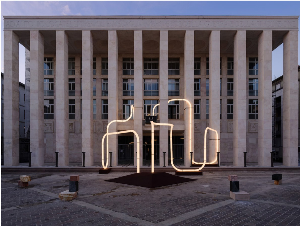
"Lights on", Bergamo – design Objects of Common Interest